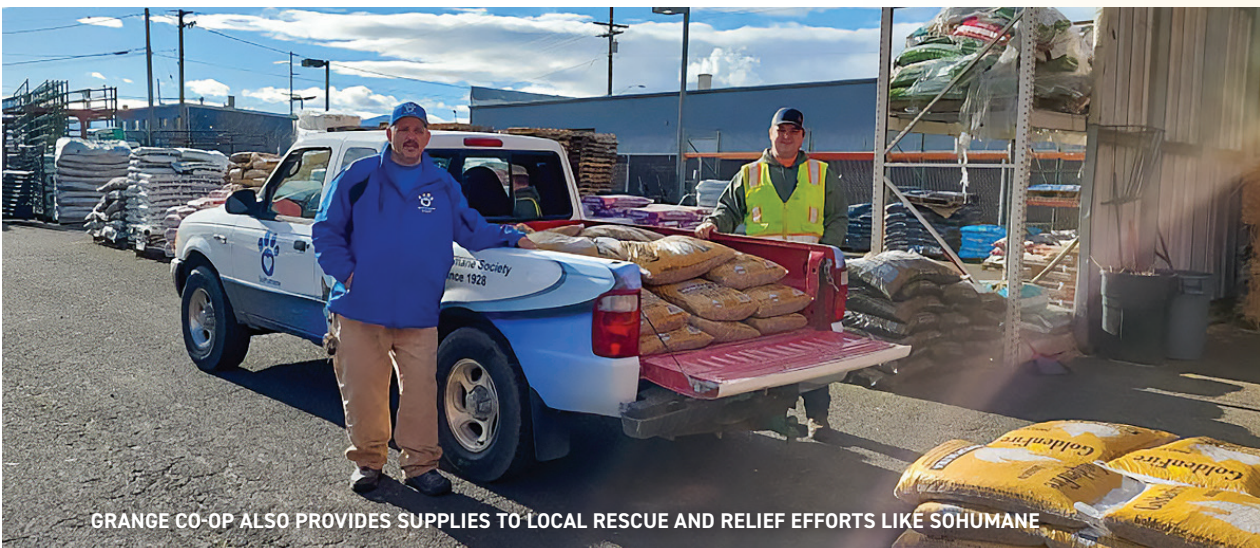
GRANGE CO-OP ALSO PROVIDES SUPPLIES TO LOCAL RESCUE AND RELIEF EFFORTS LIKE SOHUMANE

responders, and the tireless work of the fairgrounds and volunteers, many animals have found their way back home and the fairgrounds were once again able to host the fantastic Siskiyou Golden Fair.